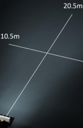
Beam Measurements - 1 Lux