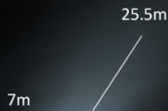
Model 770XD - Trap Beam