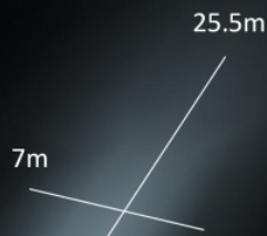
Model 770XD - Trap Beam