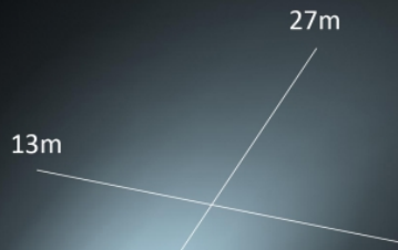
Model 832 - Trap Beam