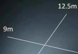
Beam Measurements - 1 Lux