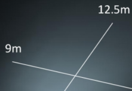
Model 840XD - Flood Beam