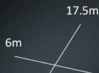
Model 840XD - Trap Beam