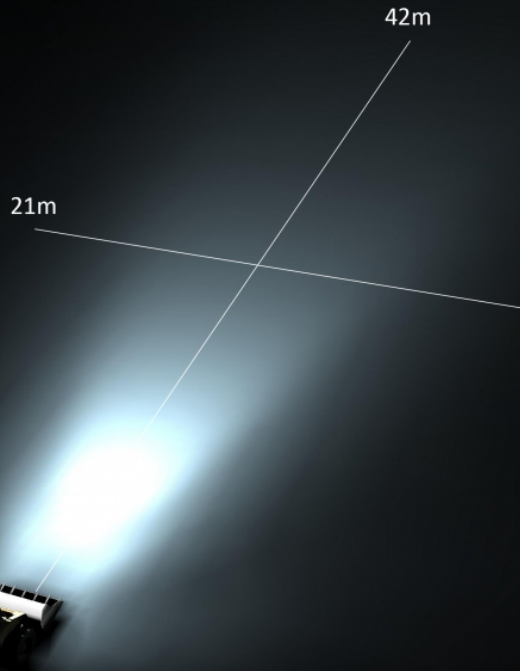
Model 623 - Wide Flood Beam